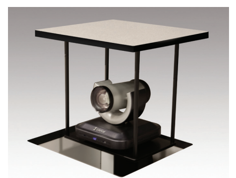
Credenza Lift close up.

made to custom fit any camera and blend seamlessly within any enclosure.