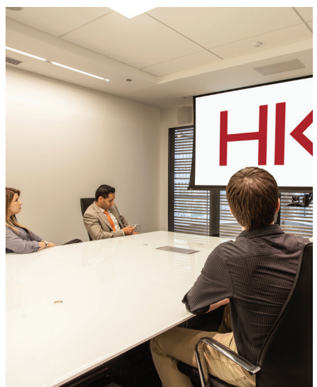
Could the videoconferencing camera in your conference room be used to spy on you—even when it isn't supposed to be on?

Could someone potentially be watching and listening to you conduct business via the videoconferencing camera in your conference room even when it isn't supposed to be on?