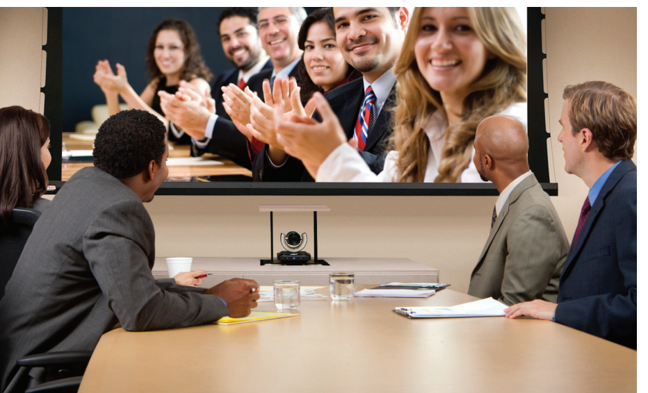
The Draper VCCL-Credenza Lift hides the camera inside a piece of furniture. It can be

In addition, Draper's Videoconferencing Camera Adapter Bracket lets you use any of our projector lifts to conceal a camera above the ceiling anywhere in the room.